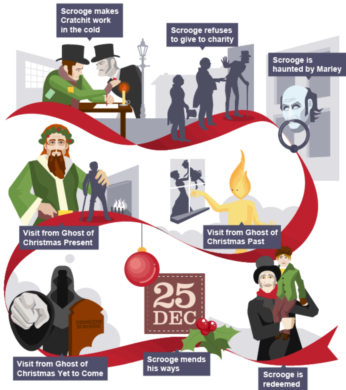
A Christmas Carol: a timeline of major plot events